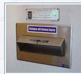
Book Drop with Traffic Light